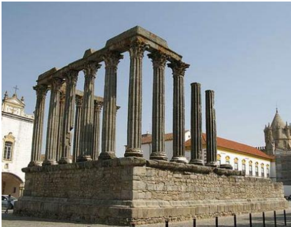
The Roman Temple of Diana

Évora has been shaped by some 20 centuries of history, going as far back as Celtic times. It fell under Roman domination, when it was called Liberalitas Julia and, among other ruins, still retains those of the Temple of Diana. During the Visigothic period, the Christian city occupied the surface area surrounded by the Roman wall, which was then reworked. Under Moorish domination, which came to an end in 1165, further improvements were made to the original defensive system as shown by a fortified gate and the remains of the ancient Kasbah. Moreover, the toponymy is indicative of the Maghreb population, which remained after the reconquest in the La Mouraria quarter of the north-east.