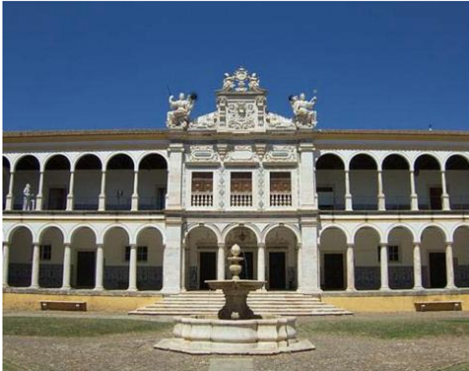
University of Évora – Claustro Espírito Santo

Wrought iron and azulejo decoration, which is splendid in the convents and palaces and very charming in the most humble dwellings, serves to strengthen the fundamental unity of a type of architecture which is perfectly adapted to the climate and the site.